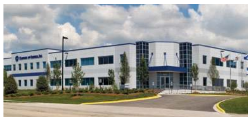
U.S. Headquarters Schaumburg, IL