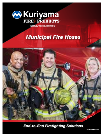
2015-current Kuriyama Fire Products