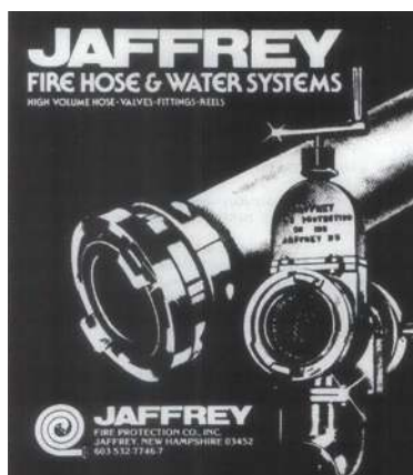
1966-1997 Jaffrey Fire Protection

Kuriyama Fire Products also utilizes the vast Kuriyama of America Warehouse and Distribution Network, based out of Schaumburg, IL with additional warehousing in Santa Fe Springs, CA; Houston, TX; Cream Ridge, NJ and Acworth, GA; providing local inventory and fast delivery where and when you need it.