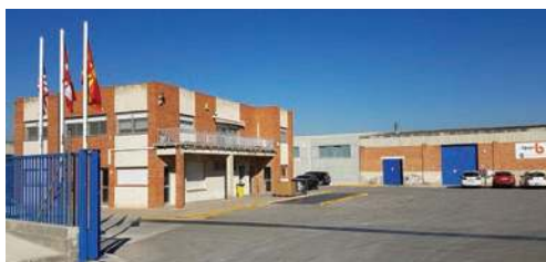
Manufacturing Facility Barcelona, Spain