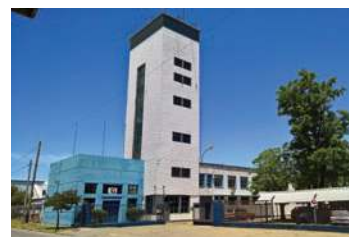
Manufacturing Facility Buenos Aires, Argentina